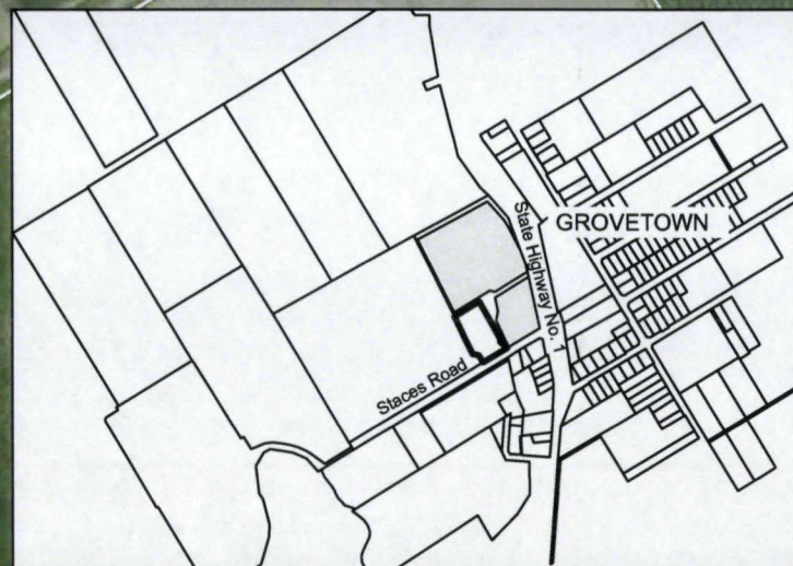
Locality Diagram 1:5000